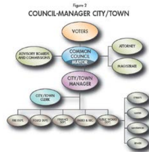
See Figure 2 for a typical organizational form of a council/manager city.

The size of municipal government has also been an important factor in the growth of the council/manager form of government. As the number of programs and activities of cities and towns grows, so does the need for full-time centralized management rather than part-time elected councilmembers. In order for the council to focus on its primary responsibility for policy making and community leadership, most cities and towns have turned to the council-manager form.