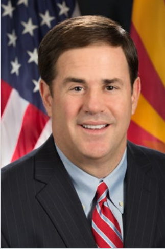
Governor of Arizona – Doug Ducey

The governor is the chief executive officer of the state and is in charge of the executive branch of government.